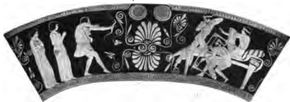
Fig. 96. Odysseus avenging himself upon the Suitors.

equally faithful keeper of cattle had been posted at the exits. So the men were slaughtered like sheep, and Odysseus and his son would have met with no resistance had not a disloyal slave smuggled in some swords and shields for those who had not yet fallen. Even against these odds